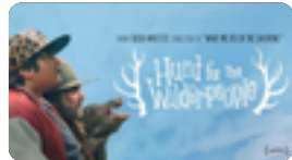
Thursday, May 29: Hunt for the Wilderpeople