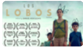
Thursday, March 27: Los Lobos

Let RHPL plan your evening out. Screen international and indie movies courtesy of our free streaming subscription service, Kanopy, and cap the night off with delicious coffee and sweet treats. Film synopses are available at calendar.rhpl.org . Registration is required.