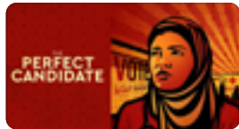
Thursday, April 24: The Perfect Candidate