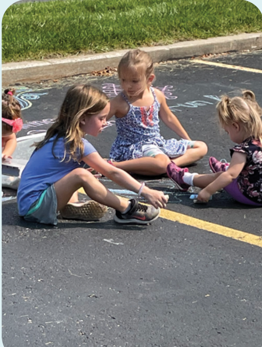
Photos: Young patrons pick out books and play at last year's summer reading finale.

Participate in RHPL's kindness activities to earn virtual activity badges and a chance to win more prizes!