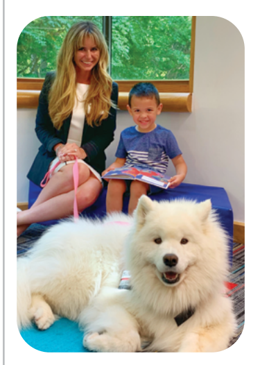
PAWS for Reading

Wednesdays: June 15 & 29, July 6, 6-7 p.m. Rochester Estates.