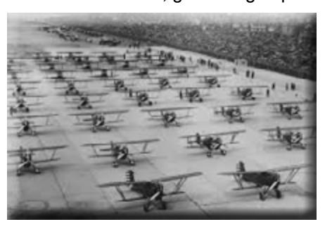
6. Selfridge Air Force Base: at the Beginning of American Military Aviation by Steven Mrozek. The Executive Director of the Selfridge Military Air Museum will discuss the origins of powered flight and military