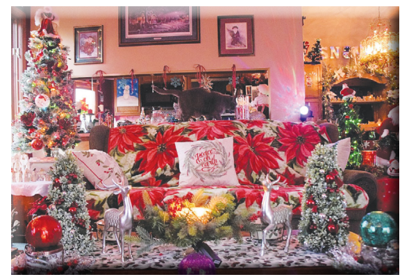
A Shelby Township Christmas extravaganza with decorating beginning in October

A Shelby Township walk in the snowflakes with many